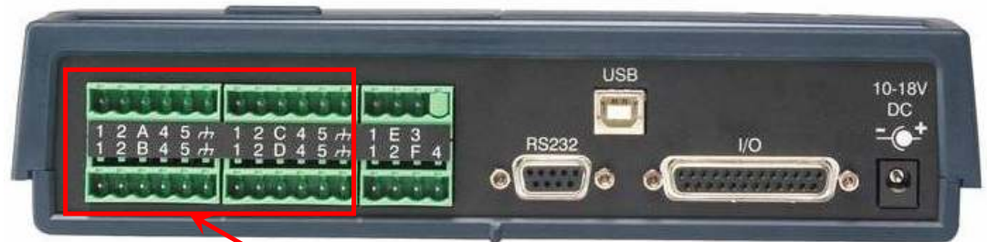
Input blocks A, B, C and D